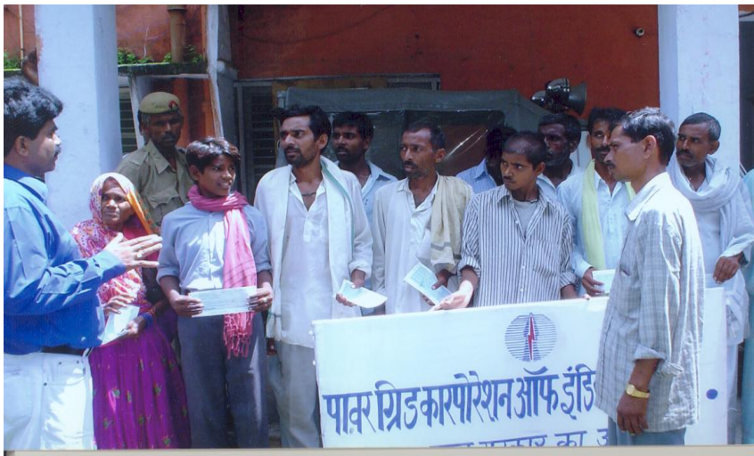
Distribution of Compensation by SLAO on POWERGRID's Initiative