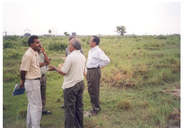
The World Bank Visit