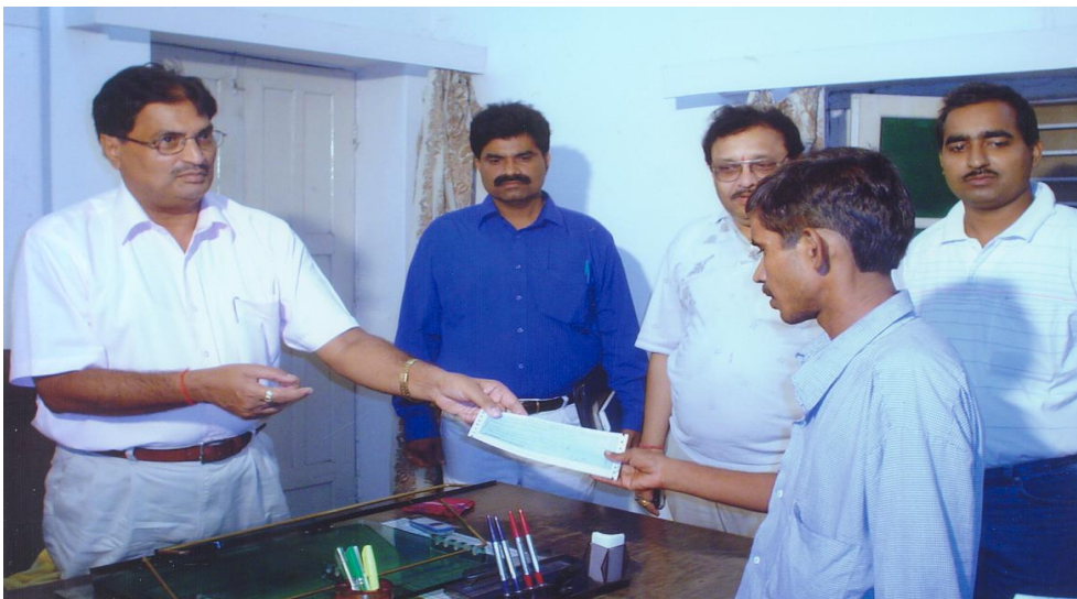
Distribution of Compensation by SLAO on POWERGRID's Initiative