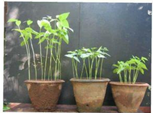
Control Under 110 KV Under 230 KV