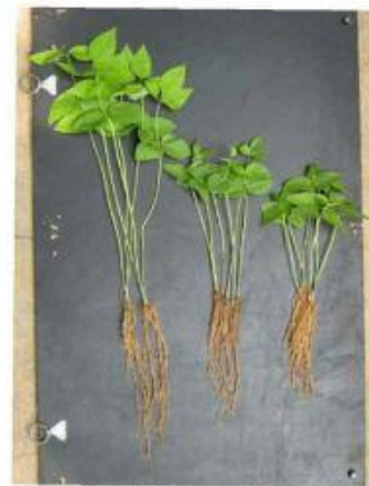
Control Under 110 KV Under 230 KV