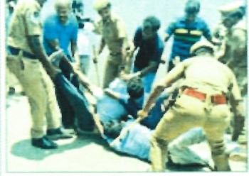
போட்டத்தில் எடுக்கப்பட்ட போல் மீது மர்மம் வரிசையில் போலீஸ் வழிகாட்டியும் இயற்றுவதற்கு உட்காரவைப்பதில் காணப்படும்

போலீஸ் தடியடிக்கு ஆயத்தமாகிய போலீஸ் தடியடி. போலீஸ் தடியடிக்கு ஆயத்தமாகிய போலீஸ் தடியடி.