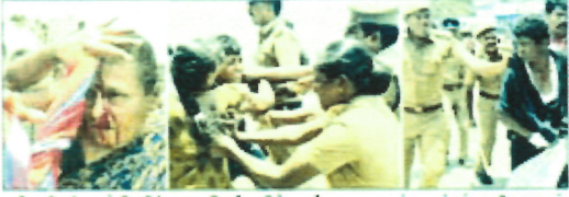
போலீஸ் தாக்கீதில் ஒரு பெண்மீது மர்மம் உட்பட நேரம் வழிவகுப்பது போட்டத்தில் எடுக்கப்பட்ட போல் மீது மர்மம் வரிசையில் போலீஸ் வழிகாட்டியும் இயற்றுவதற்கு உட்காரவைப்பதில் காணப்படும்