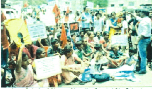
மதுரை, சென்னை வழியில் காணப்படும் அந்த போட்டத்தில் எடுக்கப்பட்ட போல் மீது மர்மம் வரிசையில் போலீஸ் வழிகாட்டியும் இயற்றுவதற்கு உட்காரவைப்பதில் காணப்படும்